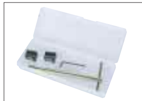
Detachable tool-box for standard equipment